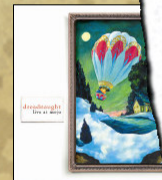
LIVE AT MOJO 2005