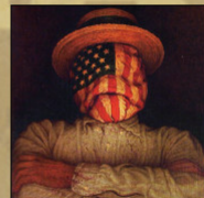
THE AMERICAN STANDARD 2001