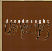
UNA VEZ MAS 2000