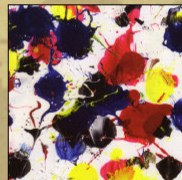
MUSICA EN FLAGRANTE 2004